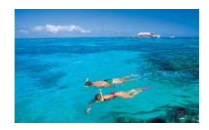
Green Island Tour